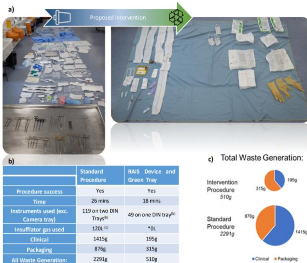
Figure 2. Comparison of outcomes from the proposed interventions showing a) reduction in waste (above), summary of the standard and proposed procedures (b) and total waste generation (c).